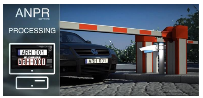
Fig. 3. Capturing car plate and translate to digital text.

Fig. 2. Determining weight for specified words.