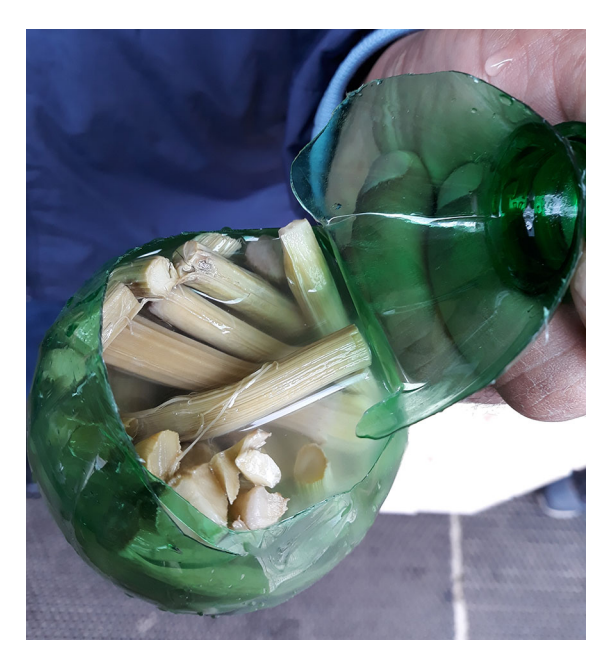
Fig. 7 Fermented young Heracleum stems brought to us by a Yaghnobi woman, but presented to us by a man from Sefedorak (23.04.19)