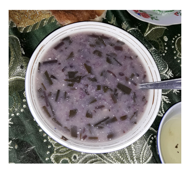
Fig. 4 Warm soup made with Allium rosenorum , rice and sour milk. Sefedorak village (23.04.19)

@—Artificially managed in the wild, letting the plant grow without light in order to produce enlarged whitish petioles. !—Name recorded only among Yaghnobi resettled from the Yaghnob Valley in Dughoba. #—Name used by Yaghnobi only in Zumand. *—Identified on the basis of folk name and plant and habitat description. Frequency of quotation: x—less than 3 people, xx—3–10 people, xxx—over 10 people