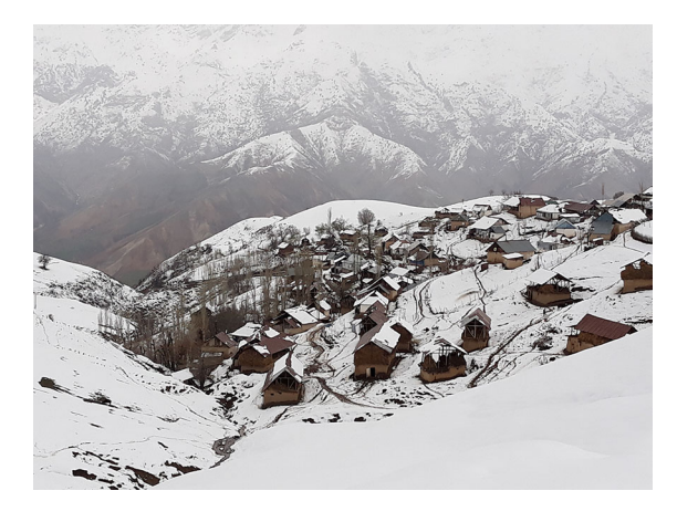
Fig. 3 Zumand village is not commonly covered with the snow at the very end of April (26.04.19)

The Yaghnobis are mainly bi-lingual, also speaking Tajik, a Western Iranian language. Some men, especially those who have worked in Russia, can also speak Russian, yet Russian-speaking women are difficult to find. Among the Tajiks, the level of spoken Russian is higher and many women speak Russian. The interviewees were selected by approaching them on the street and/or asking for the most knowledgeable people in the village. The semi-structured interviews were conducted in