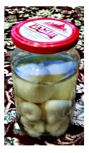
Fig. 5 Lactofermented bulbs of Allium suworowii . Rabot village (24.04.19)

taxa and the mushroom were fermented, of which Polygonum coriarium and Allium suworowii by more