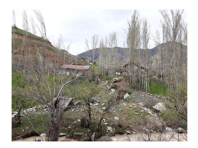
Fig. 2 Sefedorak village (23.04.19)

The Yaghnobis are mainly bi-lingual, also speaking Tajik, a Western Iranian language. Some men, especially those who have worked in Russia, can also speak Russian, yet Russian-speaking women are difficult to find. Among the Tajiks, the level of spoken Russian is higher and many women speak Russian. The interviewees were selected by approaching them on the street and/or asking for the most knowledgeable people in the village. The semi-structured interviews were conducted in