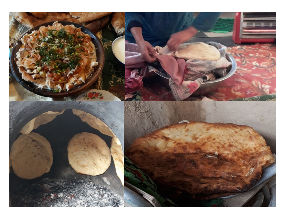
Fig. 8 Qurutob, a dish made with a simple traditional Yaghnobi flatbread fatir hamil with fried onions and sour milk. A hospitable Yaghnobi family offered us qurutob with

The general low number of used taxa by both Yaghnobis and Tajiks may already signal a