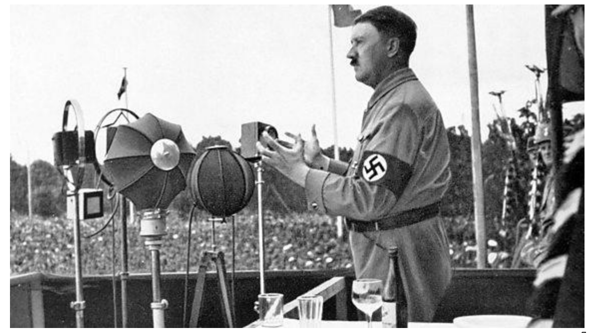
Figure 7. Adolf Hitler delivers a speech during the Party Congress at Nuremberg in 1935<sup>7</sup>

lower right-hand corner of the frieze. The tiles are kept together in groupings of 10 4x4 tiles and 4x5 tiles with wire mesh support on the reverse.