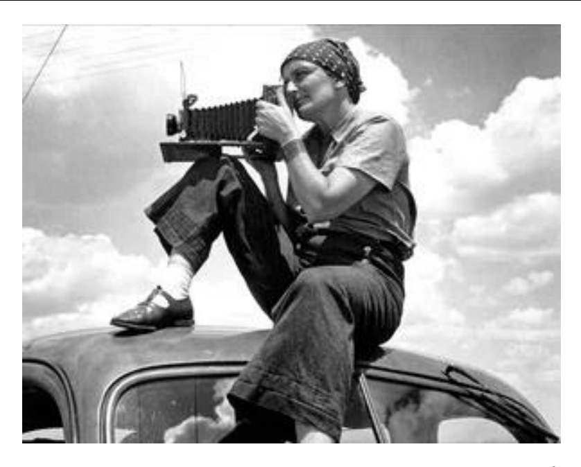
Figure 2. "Dorothea Lange pictured in Texas, circa 1934."<sup>3</sup>

Lange states: "the camera is an instrument that teaches people how to see without a camera" (Cox, 2022). In other words, her statement on the subject of the camera evokes the paradox, which has been studied by the French philosopher, Roland Barthes, in his, Image-Music-Text, as he states: "the photographic paradox can be seen as the co-existence of two messages," he points out, "the one without a code (the photographic analogue), the other with a code (the rhetoric of the photograph)" (Barthes, 1977). This creates an ethical conundrum – despite the photographic image's pretense of objectivity and neutrality, it always carries certain cultural implications and notions. A photograph's basic ideas and values are always historical since they reflect the civilization in which it was created. For this reason, images seem to provide information about a society's culture. Barthes examines a number of techniques that enable the photographer to communicate thoughts about reality: either by manipulating reality itself (montage effects, positions, and objects) or by applying codes to the image (photography, (1931) did not seek to chronicle the evolution of photography, rather, he considered the significant consequences of photography's invention on global culture. He introduces several concepts that he would later illustrate in his written piece The Work of Art in the Age of Mechanical Reproduction – in particular, the notion of "aura," in which he explains the ab-