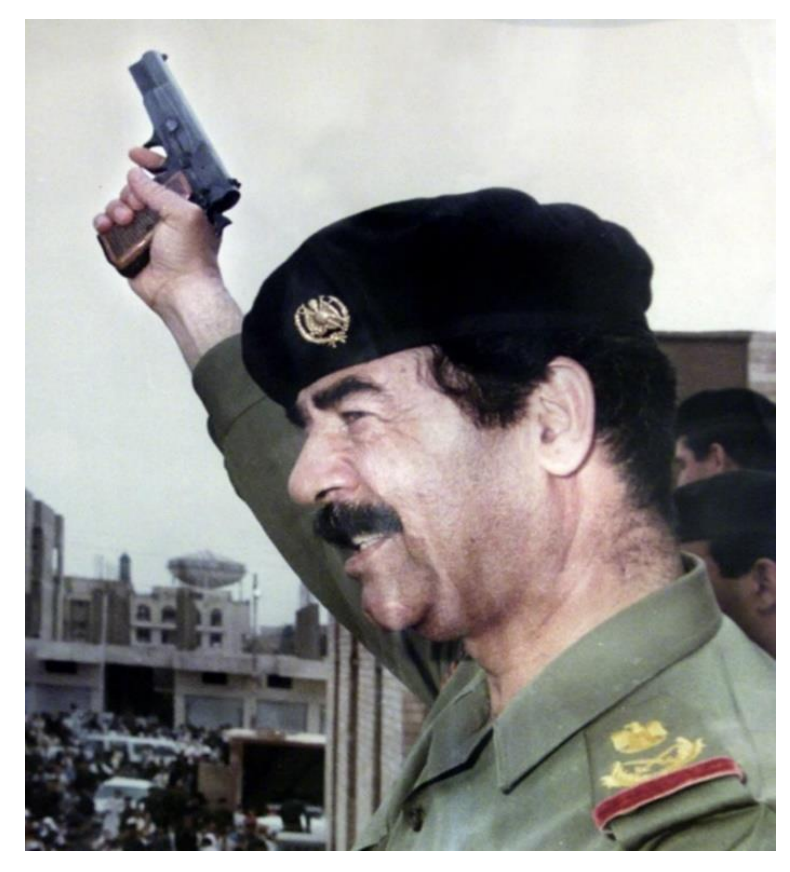
Figure 9. Former Iraqi President Saddam Hussein holds up a gun in this 1991 photograph by his personal photographer Lazim Ali<sup>9</sup>