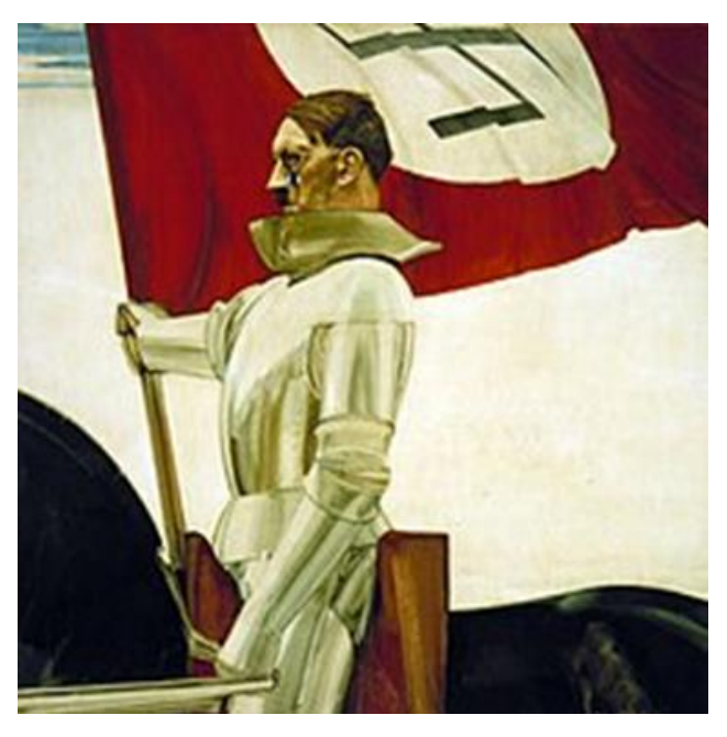
Figure 6. "The Standard Bearer" by Hubert Lanzinger<sup>6</sup>

Figure 5. "The Emperor Napoleon in His Study at the Tuileries," 1812, oil on canvas, by Jacques-Louis David, Samuel H. Kress Collection, 1961.9.15<sup>5</sup>