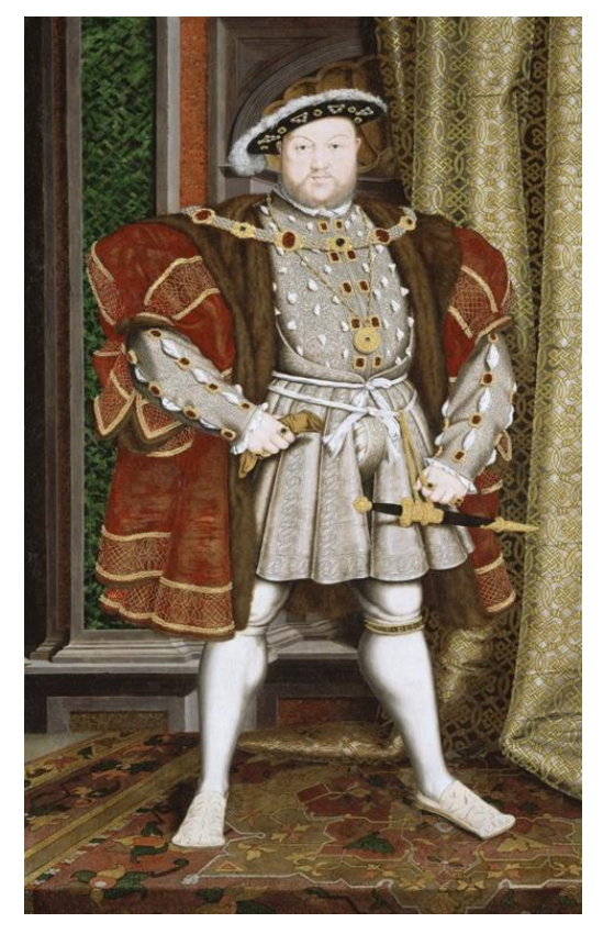
Figure 4. "Henry VIII" by Hans Holbein's workshop, ca. 1537

viewer's focus towards the subject's codpiece, which conceals his male genitalia, with the intention of capturing the viewer's attention. The codpiece is exaggerated in its big size, suggesting sexual symbolism. Thus, the painting gives an illusion that might remove all the negative thoughts that the audience has about Henry VIII's sexual inabilities. This type of depiction of a King proves how people with authority use art as propaganda for their own privileges. The depiction in the image extends beyond the representation of sexual symbols, encompassing opulence through the conspicuous display of extravagant rings and necklaces. This portrayal suggests that the figure remains impervious to societal norms, aligning with the propagandistic strategies employed to highlight King Henry VIII's immense wealth and authoritative status, where lavish jewelry, ornate embroidery, and luxurious fur serve as emblematic symbols (Kim, 2015, para, 4). During the 1530s, there was discreet speculation circulating within court circles, suggesting that the monarch was afflicted by an apparent sexual inadequacy (Wilson, 2013, para. 102).