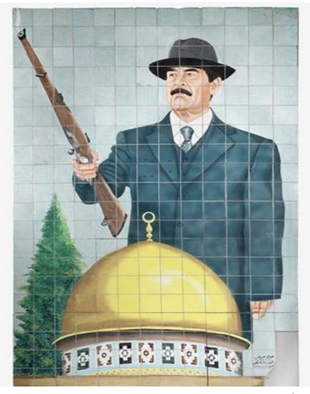
Figure 8. Tile Mosaic of Saddam Hussein.<sup>8</sup>