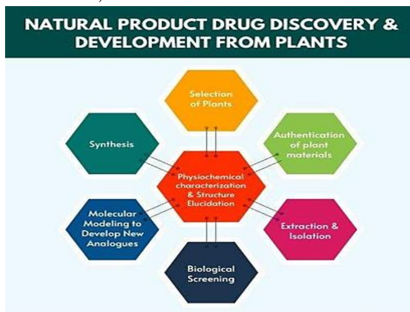
FIG 1. natural product drug discovery and development from plants

Ethnopharmacology: Ethnopharmacology involves the study of traditional medicinal practices and the use of medicinal plants by indigenous cultures[22]. Traditional healers and