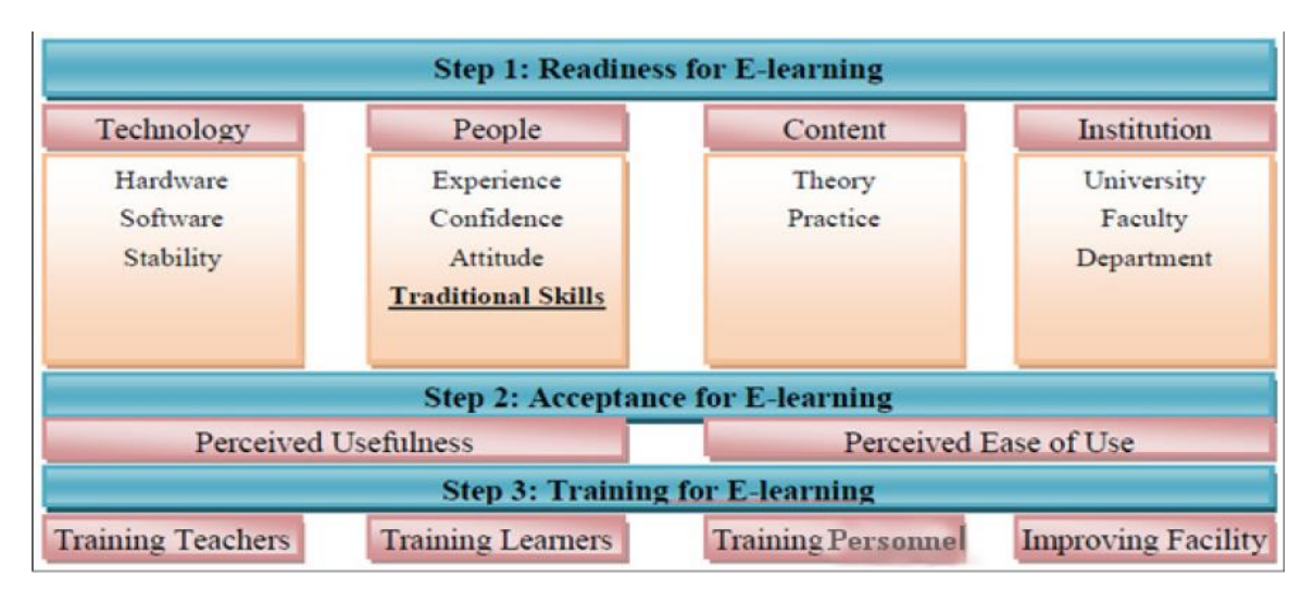
Figure (1): Akaslan and Law's model for measuring students' readiness for E-learning (Akaslan & Law, 2011).

(Akaslan & Law, 2011) engaged in very detailed research about the readiness of E-learning of university students in Turkey, the study selected students from electronic related studies. They have used a model they used in a previous study (Akaslan & Law, 2011), the model was used to assess the readiness of the teachers' side in different universities in Turkey working in electronic related studies as well. A model that uses to measure teachers' E-learning readiness has been developed by Akaslan and Law (Akaslan & Law, 2011) is suitable to measure students' E-learning readiness, because the core factors and sub-factors remain relevant. In comparing both models, we can find that the model that new factors have been added to check the traditional skills of students (e.g. management, self- responsibility, self- motivation). In Figure (1), the teachers' model and people are one of the main factors. This factor subsumes three attributes, experience, attitude and confidence. The experience of Students and the confidence in using various ICT moreover, the attitudes towards E-learning are considered as an important success factor for e-learning. Nevertheless, the 'People' factor can be refined by measuring students' traditional skills (e.g. time management, self- responsibility, self- motivation) (Ünal, Alır, & Soydal, 2014).