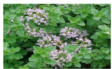
Figure 1: Aerial parts of Origanum vulgare MATERIAL AND METHODS

antiseptic, tonic and being applied in traditional medicine systems in many countries [3]. It has been widely used in agricultural, and perfumery for its spicy fragrance. The aim of this paper is to identify the chemical constituents of the essential oil of whole plant of O. vulgare by GC and GC-MS analysis.