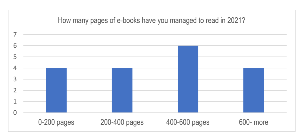
Figure 3: Male teachers' E-Book reading page rates

In Figure 2, it can be said that all female teachers spend time on e-reading, however they do not read digitally a lot.